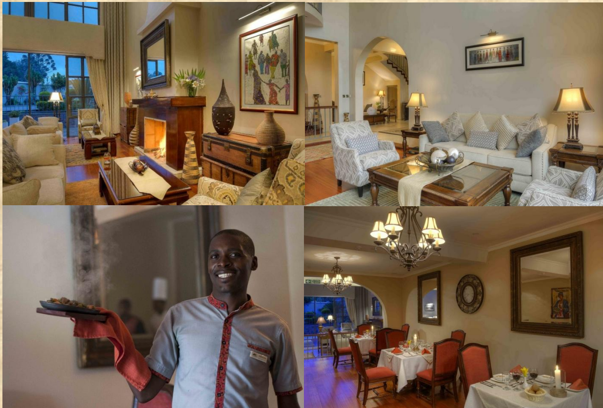
The Bishops House is located a short distance from the headquarters of the Parc National des Volcans from where guests trek on foot to see the magnificent Mountain Gorilla – perhaps one of the most dramatic, thrilling and poignant wildlife experiences possible.